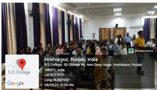
Workshop Cum seminar on Dengue and Malaria

WORKSHOP CUM SEMINAR ON DENGUE AND MALARIA on 08/08/2023 by NSS