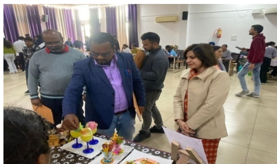
Flameless Cooking Competition