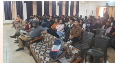
Placement drive with JIO Reliance