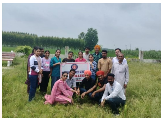
Tree Plantation at Harkhowal and Pandori Bibi villages

TREE PLANTATION AT HARKHOWAL AND PANDORI BIBI ON 11/08/2023 BY NSS DEPARTMENT