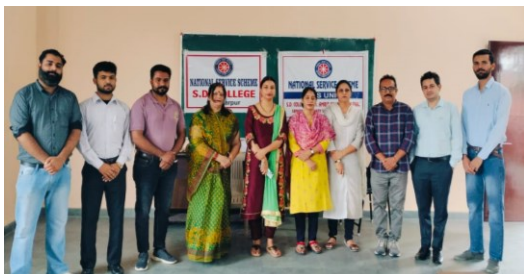
Swachata Mitra Safety Camp