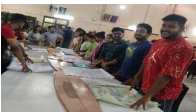
Chart Making Competition