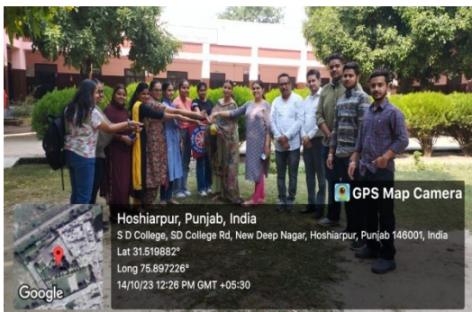
Meri Mati Mera Desh Kalash Yatra