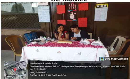
Diwali Exhibition Cum Sale

Mehndi application was done by the students of our college under the theme of " Earn while you learn initiative" on the occasion of Karvachauth on 31-10-2023 in the college campus, in which 03 students applied mehndi and earned Rs 1711/.