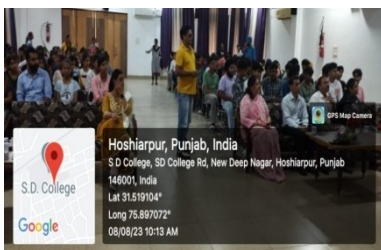
Workshop cum seminar on Side effects of Dengue/Malaria

Department of psychology and Biotechnology in collaboration with N.S.S. Since the disease is caused by Mosquitos minimizing once exposure to mosquitos would be the best type of preventing the disease. Provided in depth information about breeding sources and developmental sites of Aedes mosquitos and symptoms of dengue fever diagnosis, tests, treatments, prognosis and preventions.