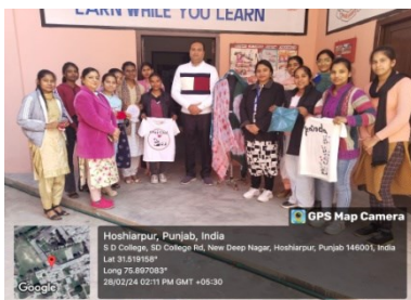
Workshop on Surface Ornamentation