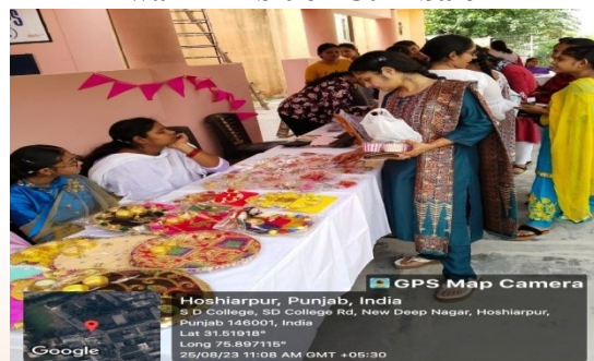
Trade Hall Carnival

Diwali exhibition-cum-sale dated 09-11-23 inaugurated by college management and officiating principal, in which six students participated and total sales was Rs. 8700/-.