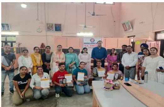
Bird's Nest Making Competition