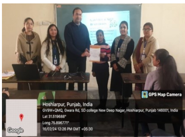
G-20 Virtual meet

Ramayudh Memorial Health Clinic, Red Ribbon Club and Department of Biotechnology of Sanatan Dharam College, Hoshiarpur in collaboration with The Arjan Vir Foundation and District Administration, Hoshiarpur organized a Stem cell awareness and Registration drive on 9th February, 2024 in the premises of the college. Need of the camp: Every 27 seconds, someone is getting diagnosed with a form of blood cancer/disorder. Procedure of taking a sample: Saliva swab from the mouth. Benefit: A group of potential donors can be enrolled, and if a swab is found to be compatible with a patient suffering from blood cancer or related illnesses, it has the potential to save the patient's life timely from blood disorders.