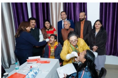
Stem Cell Awareness Drive

Ramayudh Memorial Health Clinic, Red Ribbon Club and Department of Biotechnology of Sanatan Dharam College, Hoshiarpur in collaboration with The Arjan Vir Foundation and District Administration, Hoshiarpur organized a Stem cell awareness and Registration drive on 9th February, 2024 in the premises of the college. Need of the camp: Every 27 seconds, someone is getting diagnosed with a form of blood cancer/disorder. Procedure of taking a sample: Saliva swab from the mouth. Benefit: A group of potential donors can be enrolled, and if a swab is found to be compatible with a patient suffering from blood cancer or related illnesses, it has the potential to save the patient's life timely from blood disorders.