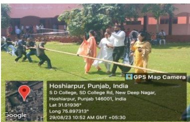
Tug of war Competition

Chart Making Competition was organized by the Department of Management on 29 August 2023.Total 11 students participated in it.