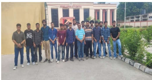
NSS Volunteers participated in Drug Abuse Campaign