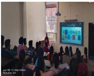
Short term Course on Data Science using Python