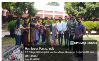
INTERNATIONAL DEMOCRACY DAY