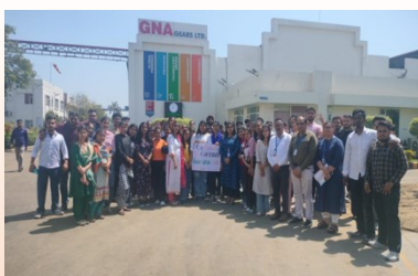
Industrial Visit GNA Gears