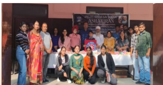
Exhibition of Candles by JSS Asha Kiran Special School, Jahankhela