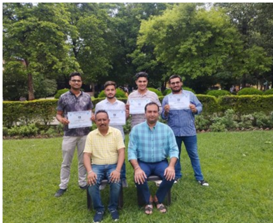
Students were honored with AZAD AWARD 2023

STUDENTS OF SANATAN DHARMA COLLEGE, HOSHIARPUR WERE HONORED WITH AZAD AWARD-2023 on 07/08/2023 by NSS