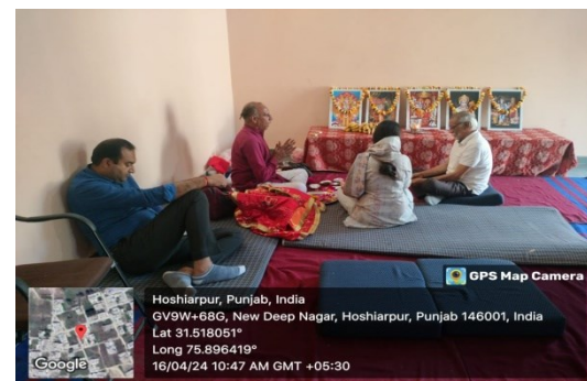
Ramcharit Manas Path