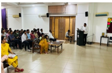
Seminar on Victim Compensation Scheme

A Seminar was organised by Legal Aid Club on 22 Aug 2023 in the college campus. The topic was Punjab Victim Compensation Scheme 2017 and NALSA Compensation Scheme for Women Victims/ Survivors of Sexual Assault/Other Crimes-2018.