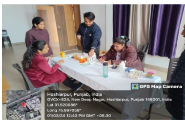
Blood Grouping and Blood Testing