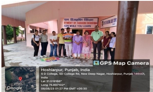
Talent Hunt Fine Art competition