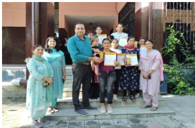
Poster Making Competition

Poster Making Competition organized by ANTI RAGGING COMMITTEE, HISTORY DEPARTMENT, SOCIAL SCIENCE COUNCIL IN COLLABORATION WITH IQAC on 18/08/2023