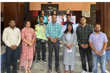
Chart Making Competition