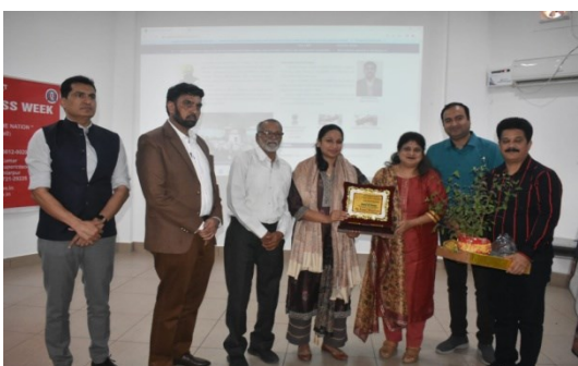
Celebration of Vigilance Awareness Week