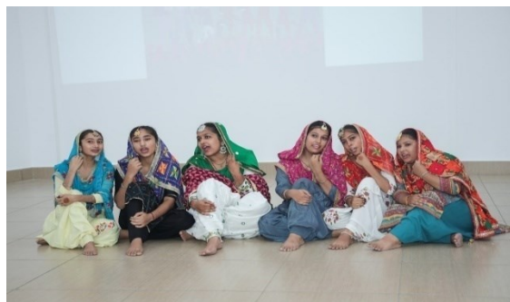
Talent Hunt Cultural Competition

A total of 21 teams of 42 students participated in the competition and prepared mouth-watering dishes. A number of students participated in the stage comparison, photography for the event as well as the managing of the event.