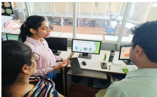
PowerPoint Presentation Competition

A PowerPoint Presentation Competition was organized on the occasion of 12th August, 2023 on the occasion of International Youth Day. The theme was "Green Skills for Youth: Towards a Sustainable World".