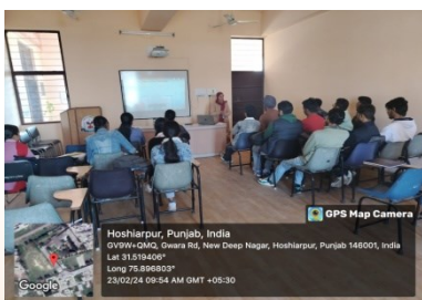
Documentary on Anti Ragging