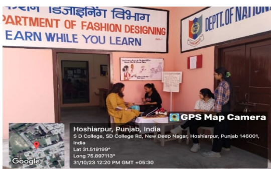
Mehndi application on the occasion of Karvachauth